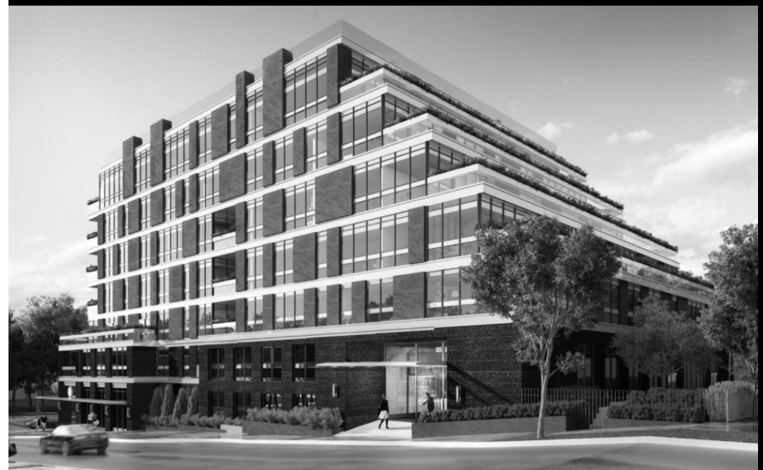
Avenue & Park (Toronto, ON) Artist's Concept