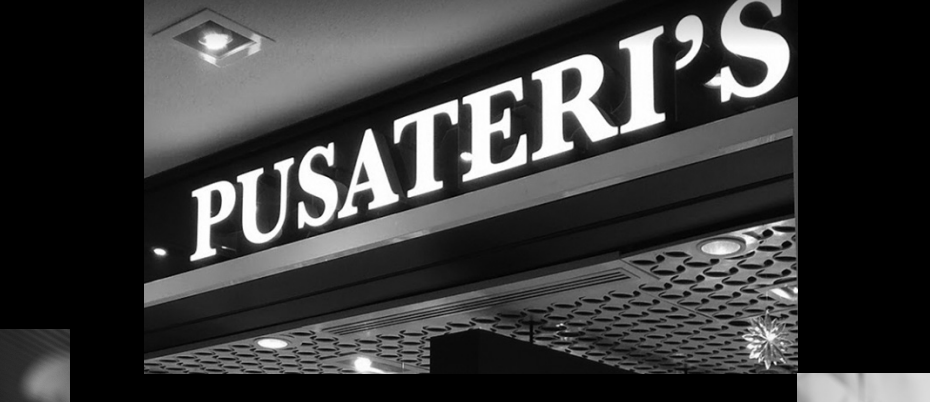
Pusateri's Fine Foods at Bayview Village A great selection of exceptional branded food, drink, and fine pastry.