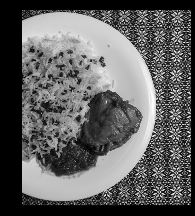
Toranj Fine Foods Laid-back eatery offering Persian fine foods such as savoury rice and salad dishes.

One taste of this neighbourhood and you'll be hooked. Fine dining, innovative, original menus and foodie favourites abound, including renowned chefs and a Michelin inspired eatery. Staying in? Gourmet grocers offer exceptional prepared meals and unique pantry staples.