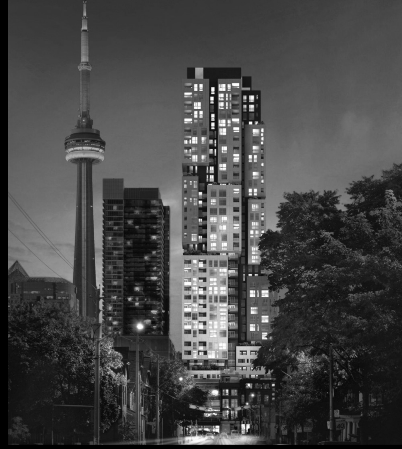
Picasso (Toronto, ON) Artist's Concept