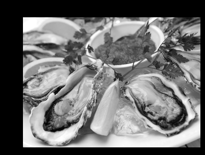
Nomé Izakaya Japanese fusion fare and sake served in a modern wood and stone accented space. Also famous for their Oyster Bar.