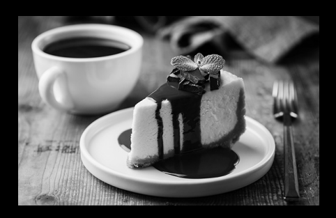
Bread & Roses Small and cozy bakery cafe, featuring delicious cakes.