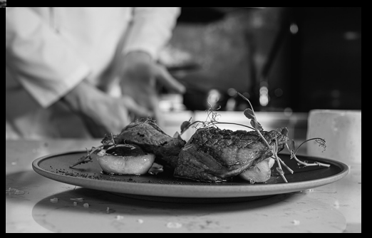
Oliver & Bonacini Café Grill Refined Italian restaurant that serves pastas, wood-fired pizzas and international dishes.