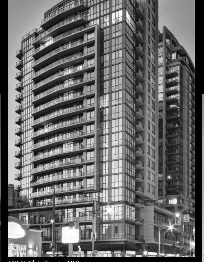
530 St. Clair (Toronto, ON) Artist's Concept