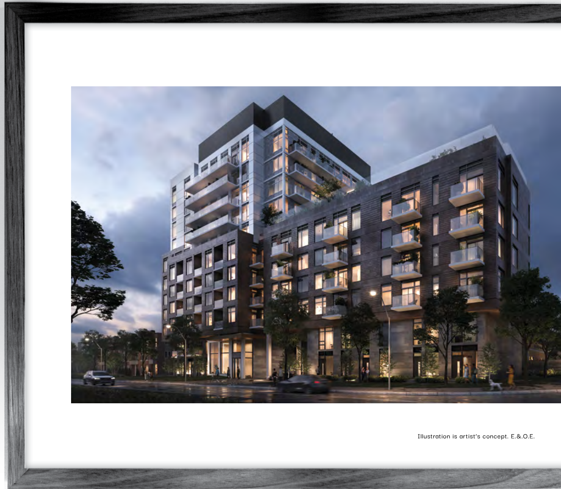
Illustration is artist's concept. E.&O.E.