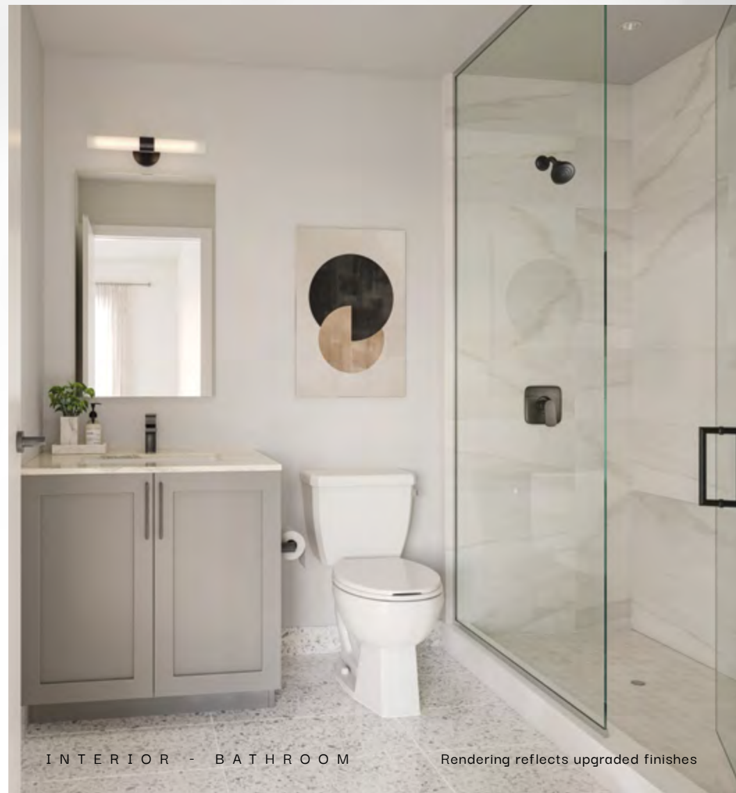
INTERIOR - BATHROOM

Infused with modern flair, the suites at BLVD.Q balance comfort and sophistication. With bright interiors and thoughtful layouts, enjoy an open living space with plenty of natural sunlight. Functional design extends to the kitchen and spa-like bathrooms, with playful touches inspired by the elements of nature nearby. This is your urban oasis - a place to recharge for your next adventure.