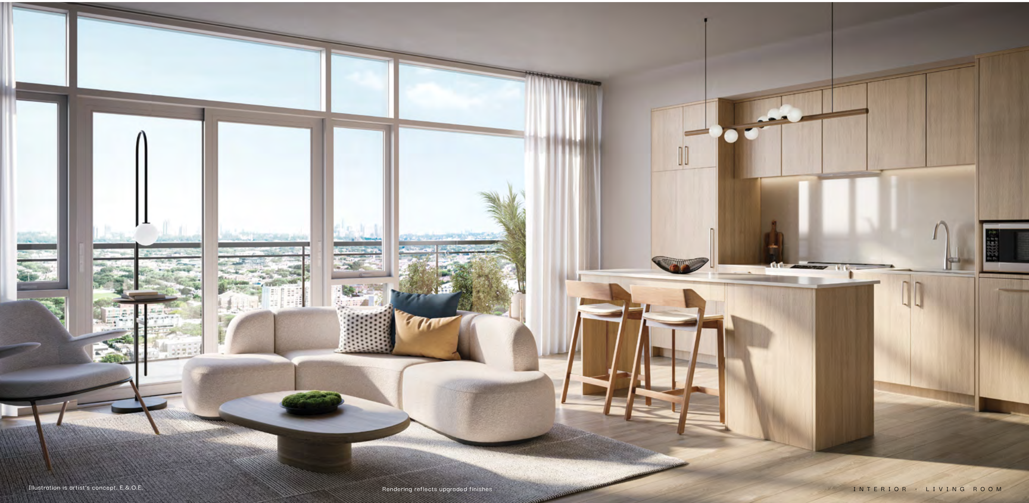
Illustration is artist's concept. E.&O.E.