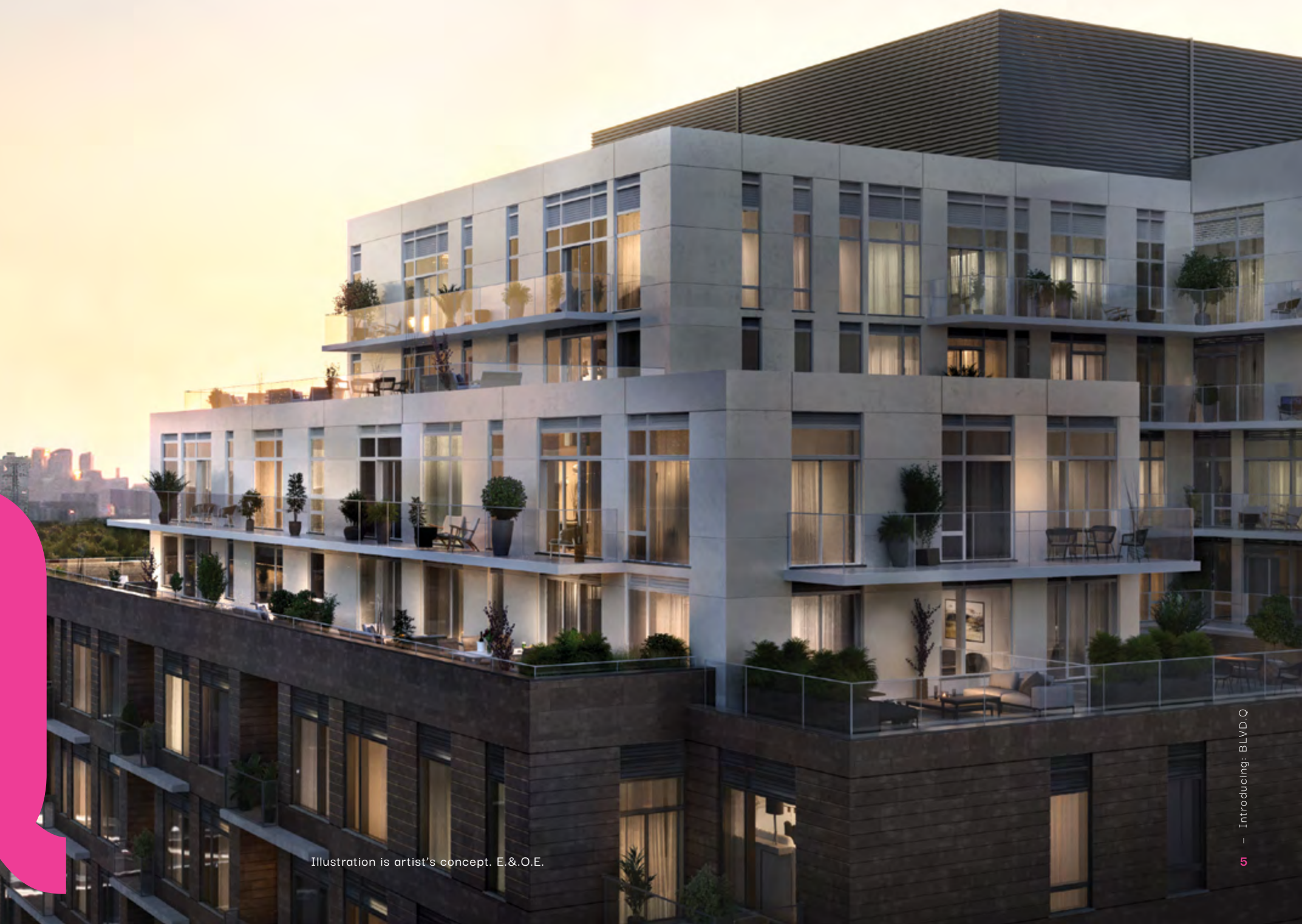
Illustration is artist's concept. E.&O.E.

The Queensway is the heartbeat of South Etobicoke. This is where people come to shop, eat, be entertained, and gather with friends. With transit and highways keeping you connected, and with exclusive amenities that cater to your lifestyle, this is picture perfect living.