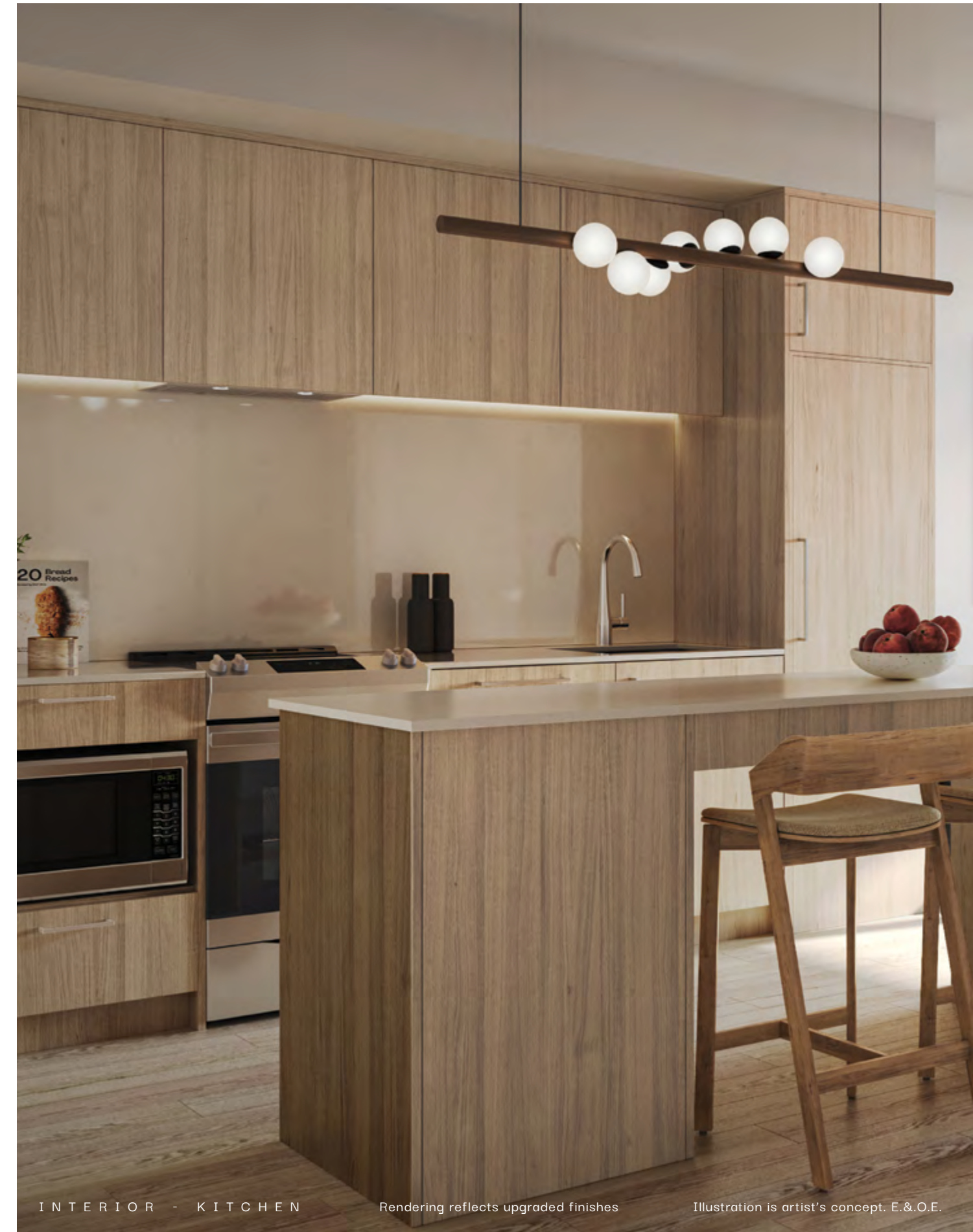
INTERIOR - KITCHEN