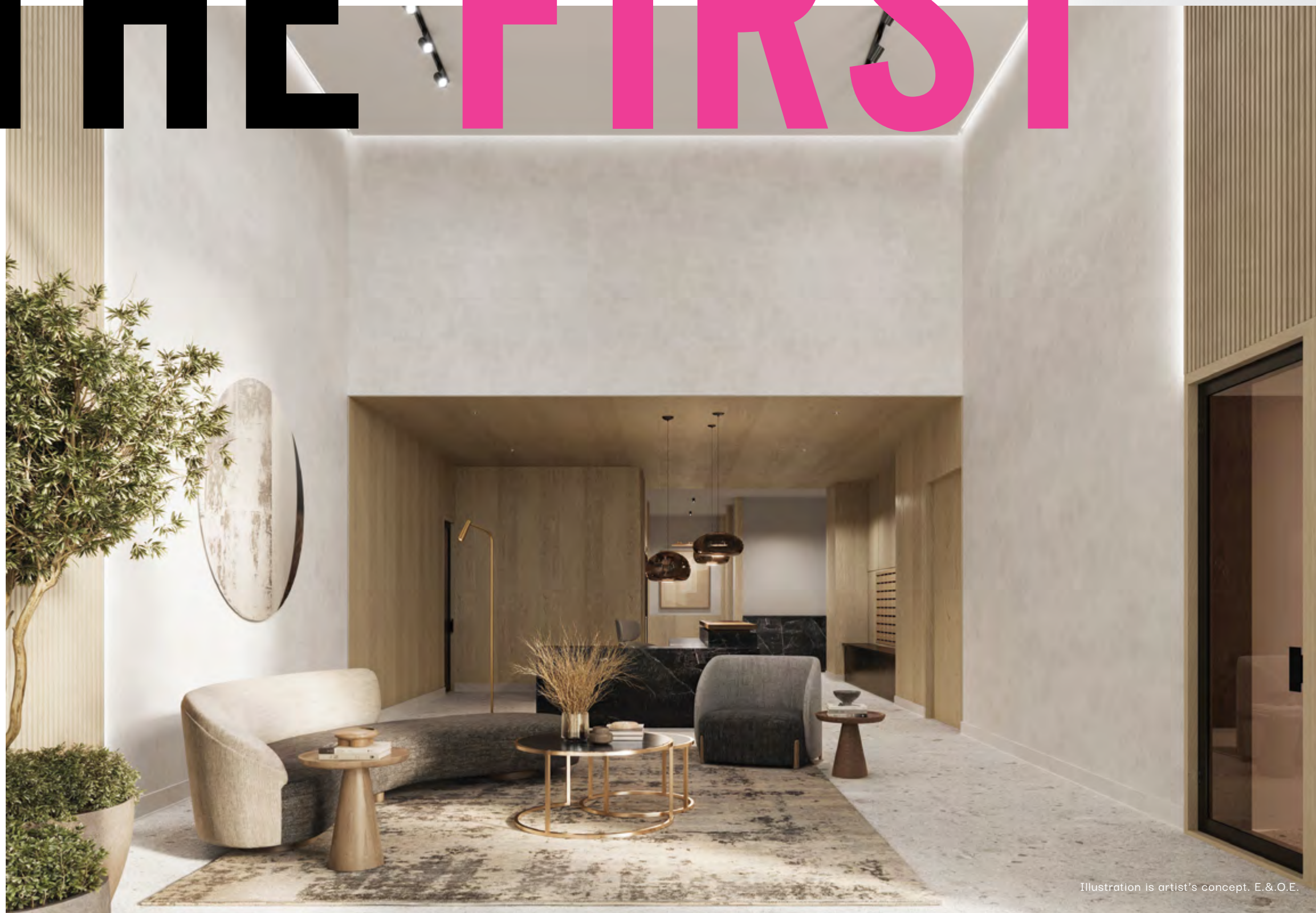
Illustration is artist's concept. E.&O.E.